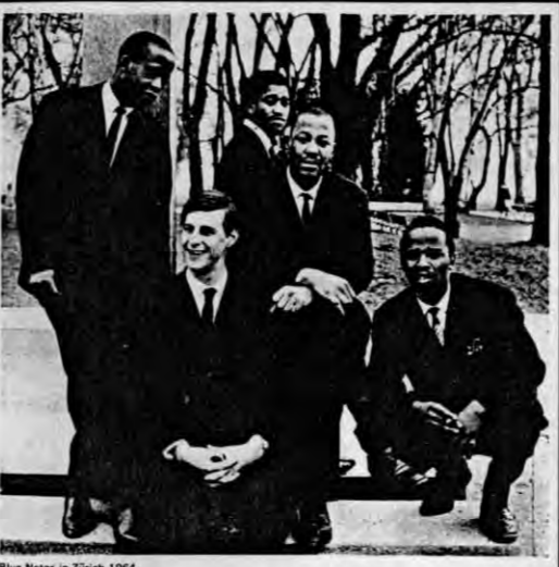
Blue Notes in Zürich 1964