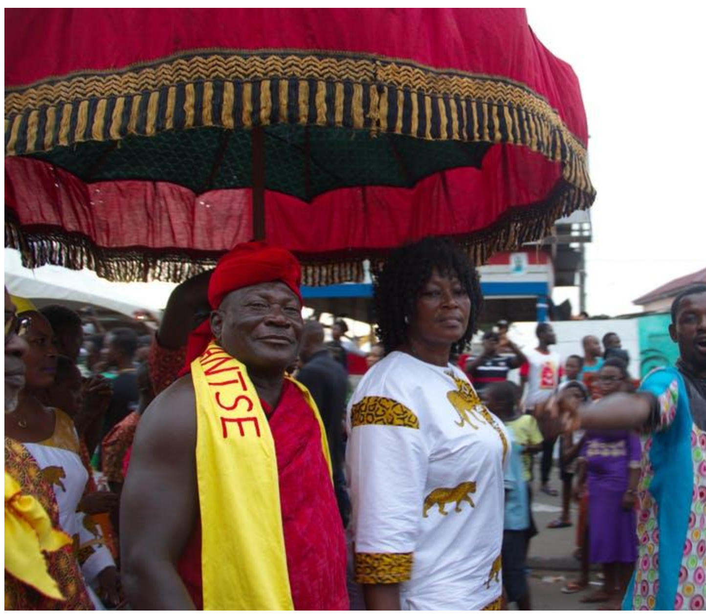
A street procession during the Chale Wote festival in 2018. Ruth Simbao

For the past eight years at the end of every August the James Town suburb of Ghana's capital Accra has been taken over by the <u>Chale Wote street art</u> <u>festival</u>. During the festival, thousands of people, including local celebrities, artists, musicians, <u>boxers</u> and everyday revellers, move up and down the streets mostly by foot and at times on roller skates or unicycles.